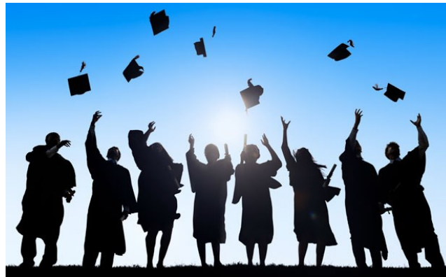
Congratulations to all graduates.